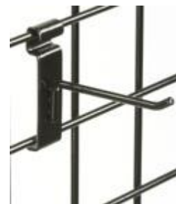
GRID WALL HOOK