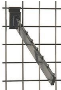
7-BALL WATERFALL HOOK